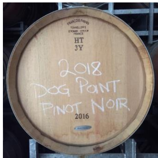
Dog Point's 2018 Pinot Noir maturing in barrel.

A: Just quietly, we have the largest organic vineyard in New Zealand.