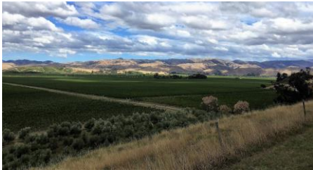
A view from one of the Dog Point vineyards.

Dog Point is proud of their certified organic status, a distinction earned under the BioGro New Zealand Programme.